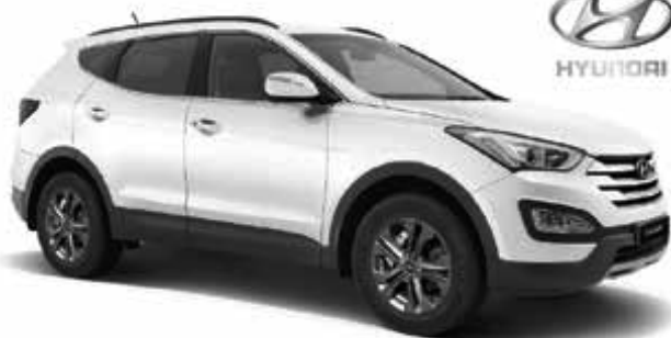
Hyundai Santa Fe